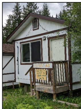
Mountain View Cabins Golden, British Columbia

I crossed into Canada west of Glacier National Park at the Roosville crossing, where it was once again raining. I stayed at Mountain View Cabins North of Golden, BC on Hwy 1, and really enjoyed this location.