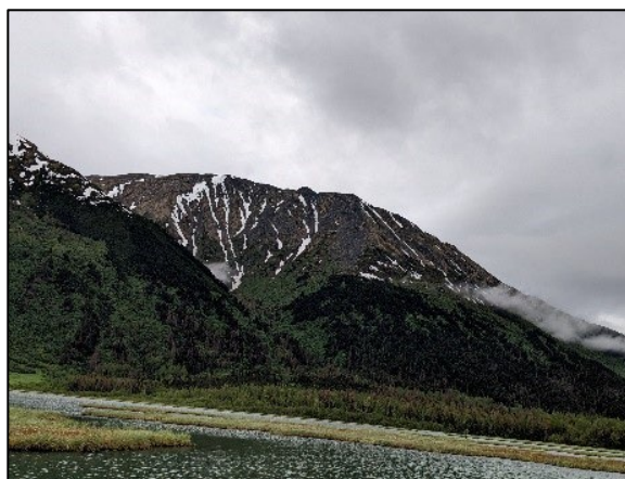
Mountain View – Promise delivered!