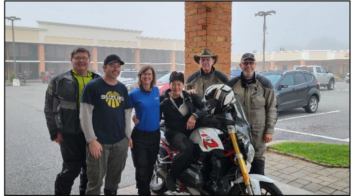
Riders with Foggy "Fall Color"

where we enjoyed an entertaining night of stories from the road, with riders kicking lies and telling tires .