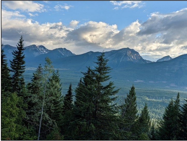
On the way to Prince George, British Columbia

The next day I backtracked to Golden and followed Hwy 1 to Lake Louise. This is a wonderful road up and through the Rocky Mountains. I then headed to the Icefields Pkwy on Hwy 93. Though very busy it was really beautiful! Out of Jasper, I took Hwy 16 to Prince George.