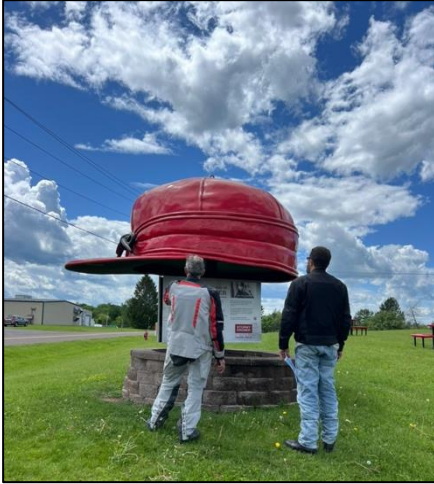
Man #1, “That’s a big cap.” Man #2, “Yep.”

Stormy Kromer is famous for its iconic winter cap featuring ear flaps similar to that worn by Walter Matthau in the movie, Grumpy Old Men, as well as Elmer Fudd, while hunting that “wascally wabbit”, Bugs Bunny – two movie stars who I’ve successfully modeled my life after. With the highlight of our day – nay the trip – now firmly under our belt, we headed to the nearby Suffolk Street Eatery which offered a range of scrumptious salads and sandwiches, often with clever names like Notorious P.I.G. or the Bada Bing, for its patrons to enjoy.