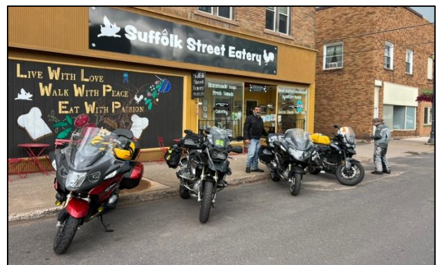
Mandatory Photo of Actual Motorcycles

We have a fun route to Shanty Creek via Mancelona Road, just outside our door, it’s a great ride, great road surface, and twisty end to your ride to Shanty Creek!