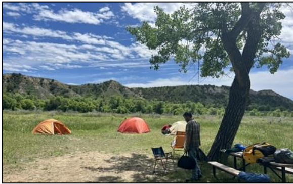
It doesn't look freezing cold, but...

pleasure of seeing bison herds (not technically “buffalo”, which are native to Africa) including two solitary males that stood along the side of the road.