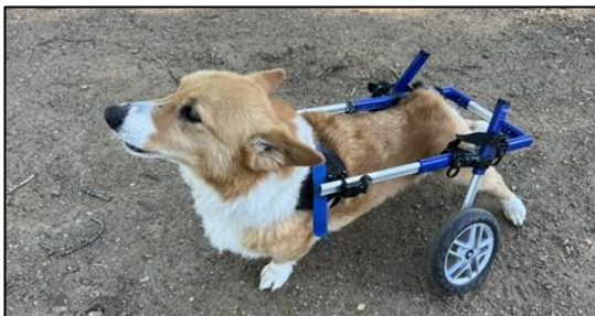
Cody, Badass Campground Pup

Day 6 (June 8, 2024) – We got off to a rough start, having not anticipated temperatures would dip so low. Rated for 30°F, my sleeping bag did not keep my gilets warm. I scrambled in the middle of the night multiple times to don yesterday's sweaty socks and other garb in an effort to stave off the frosty cold. The morning sun couldn't come fast enough.