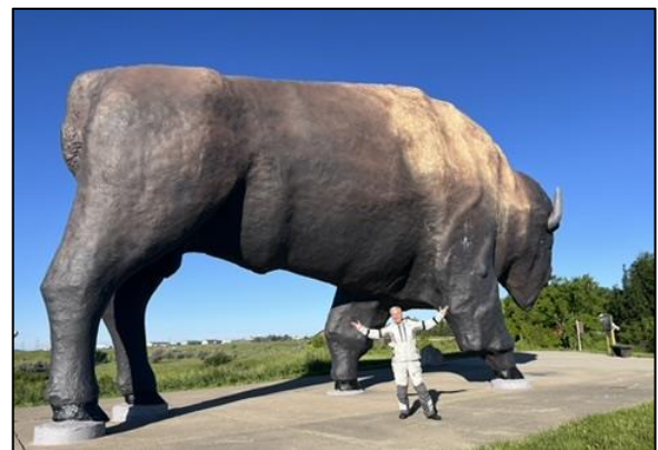
Kent, AKA “Dwarfed by Tatanka”

Upon arrival, we secured our camp site, staked our claim by setting up our tents, and headed into town for a bite to eat. We then rode a 22-mile, sight-seeing loop around the central section of the park with several lookout points offering beautiful vistas of the wind- and water-ravaged landscape. Here we had the